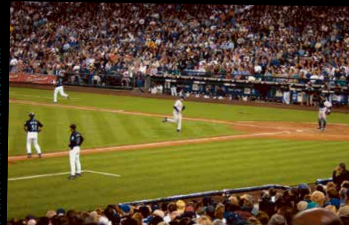
Seattle Mariners baseball