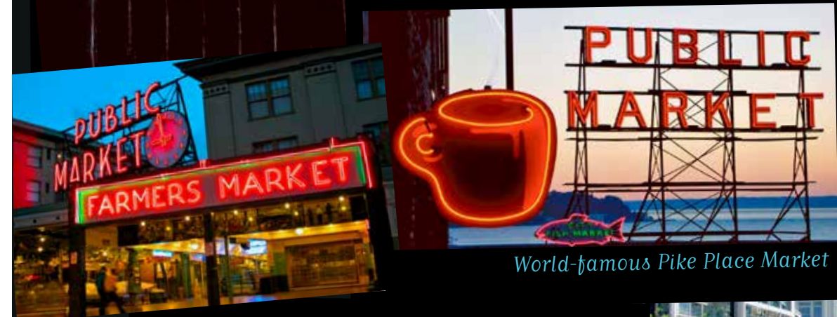
World-famous Pike Place Market